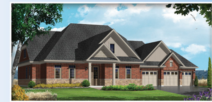
Bungalow Loft Elev-A -3133 sq.ft.