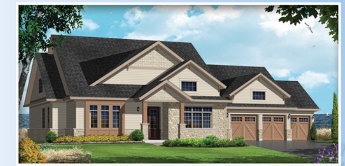
Bungalow Loft Elev-B -3133 sq.ft.